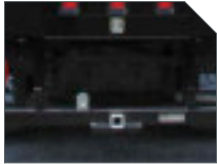
8' UNDERBODY STORAGE COMPARTMENT