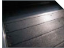
PINE WOOD OR APITONG WOOD FLOOR