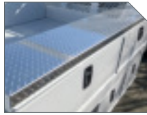
ALUMINUM TREAD PLATE OVERLAY