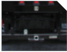
8' UNDERBODY STORAGE COMPARTMENT