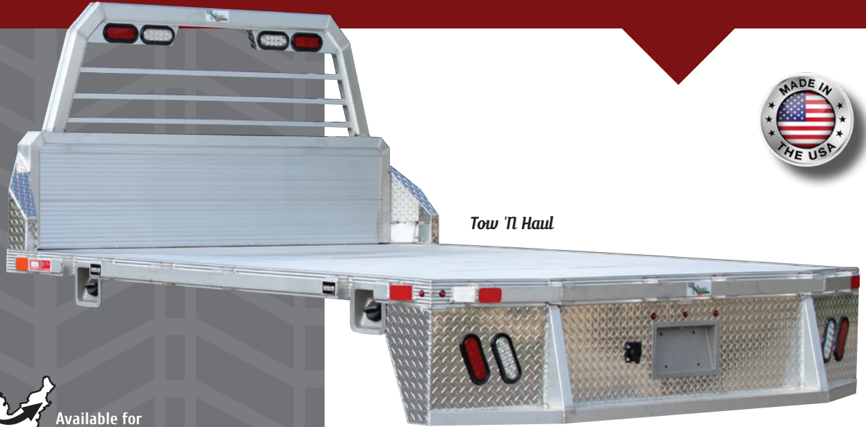
Tow 'N Haul