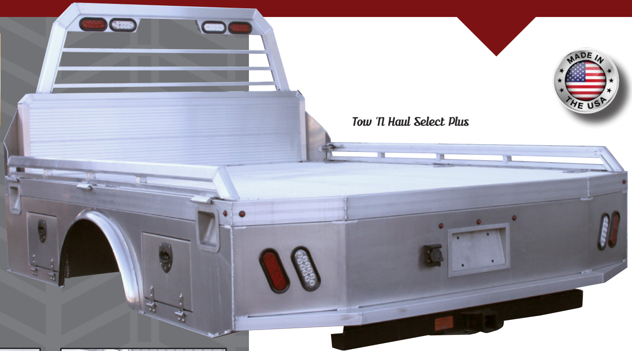
Tow 'N Haul Select Plus