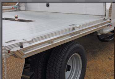
Tow 'N Haul Select Fold-Down Rail Kit