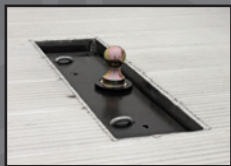
Gooseneck Hitch & Trailer Plug