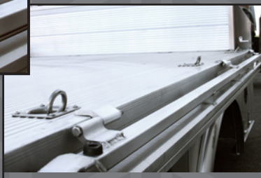
Fold-Down Rail Kit