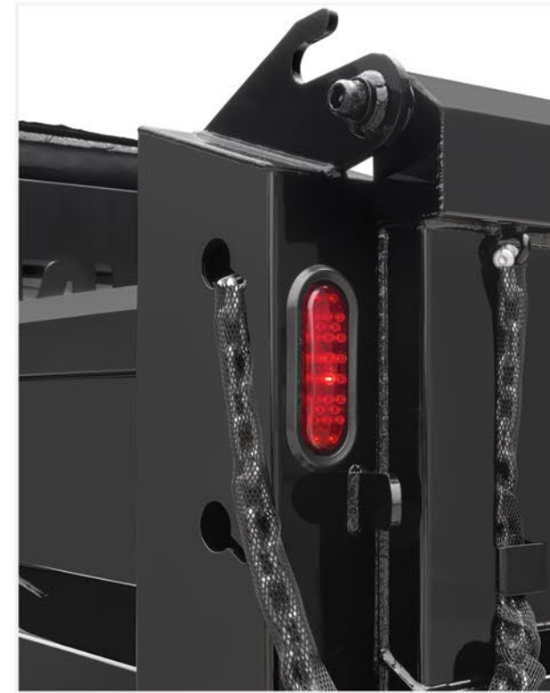
Heavy-duty mesh chain covers and redundant recessed lighting enhance safety.

Welded steel assembly, 17" high 10-and-12-gauge double sidewalls, a 10-gauge steel floor, and a 23" 12-gauge steel dump/swing gate make a Morgan body tough-enough to handle whatever the job requires. That promise is backed by Morgan's 3 Year Warranty AND a reputation for innovative design and quality construction that spans over 60 years!