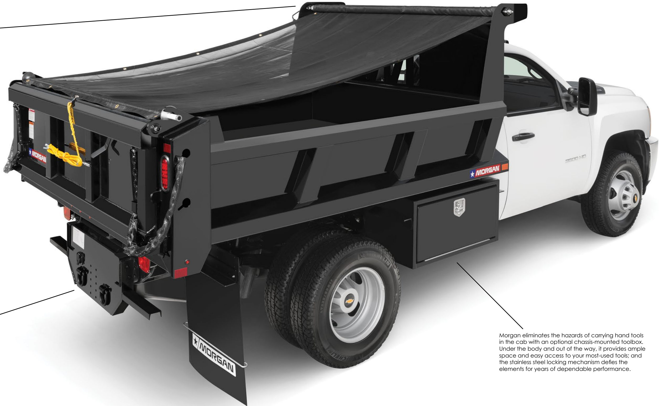
Morgan's heavy-duty hitch plate and tow rings make it easy to mount any hitch configuration and safely tow.