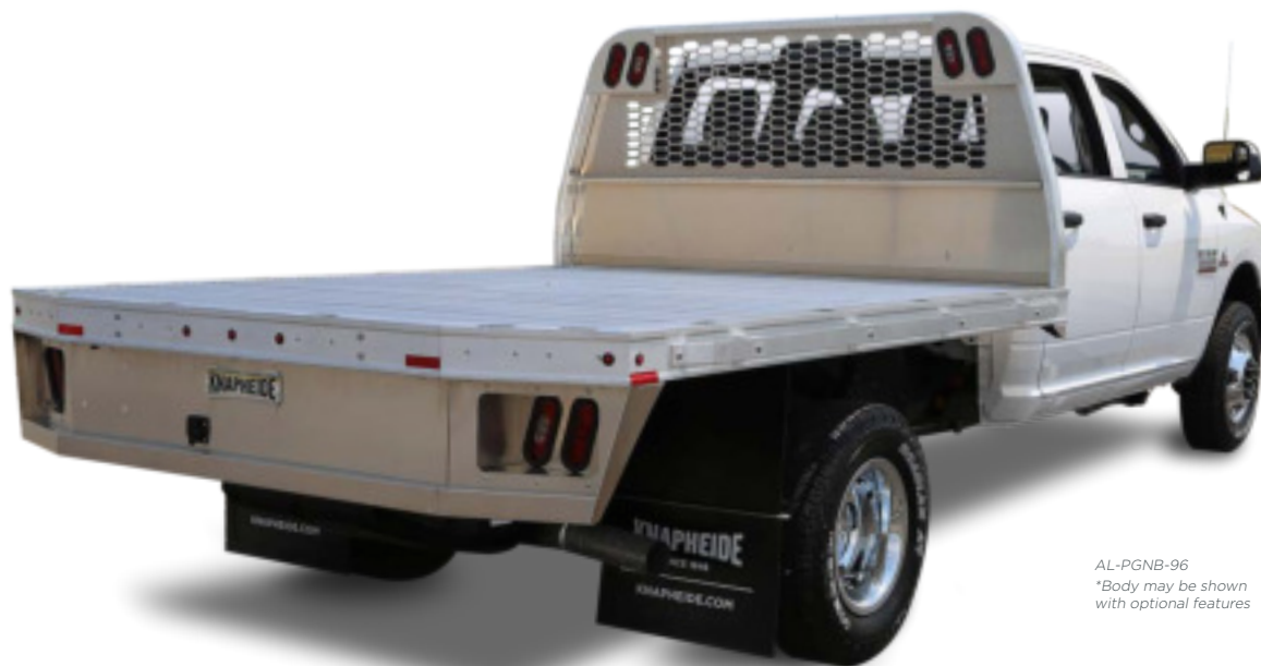
AL-PGNB-96 *Body may be shown with optional features

The Knapheide Aluminum Gooseneck features aerospace technology assembly utilizing military-grade aluminum extrusions. What does this mean? This means a rugged work body that is 40 percent lighter than steel to provide more payload for the haul. With a gooseneck hitch system rated at 30,000 lbs. you can rest assured that this aluminum flatbed can handle your heaviest of loads. The aluminum construction gives you better protection against corrosion ensuring your aluminum truck bed will last for years to come.