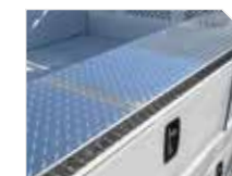
ALUMINUM TREAD PLATE TRIM