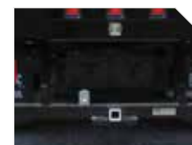
8' UNDERBODY STORAGE COMPARTMENT