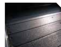
PINE WOOD OR APITONG WOOD FLOOR