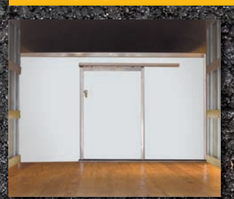
Sliding cab-access door