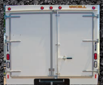
Full width rear swing-out doors