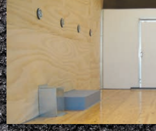
Plywood lining with D-rings