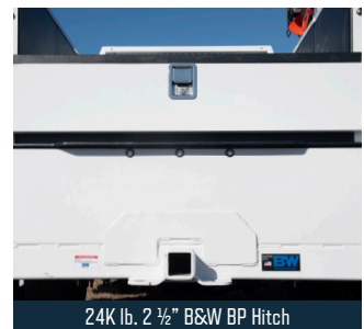
24K lb. 2 1/2" B&W BP Hitch