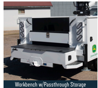
Workbench w/Passthrough Storage