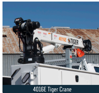
4016E Tiger Crane

NOTABLE OPTIONS SHOWN: Optional Customizable CARR Sidesteps under Compartments; Remote Control T Handle Compression E-Lock Latches