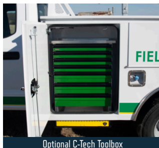
Optional C-Tech Toolbox