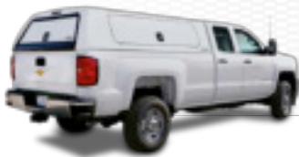
// PRO CH (Cab High) KNAPKAP