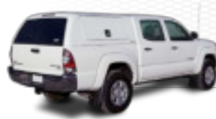
// PRO CH-S (Cab High-Sport) KNAPKAP