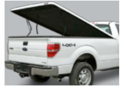
Pro Cover in the open position

*Body may be shown with optional features