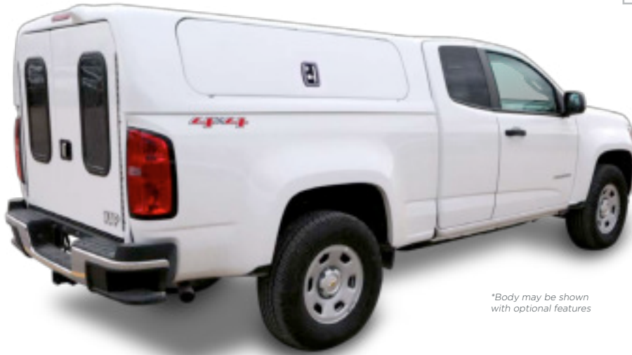
*Body may be shown with optional features

Designed to match the cab height of your truck, the KnapKap Ultra Cab High Utility is light, efficient and durable. Double vertical rear doors increase your efficiency by giving you full access to your cargo.