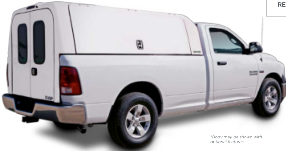
*Body may be shown with optional features

Get the most out of your pickup with the KnapKap Supreme Utility. Commercial grade reinforced fiberglass, oversized doors, accessibility, durability and lightweight construction make this KnapKap the best commercial topper available.