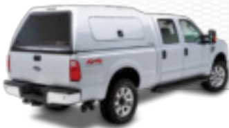
// PRO OC (Over Cab) KNAPKAP