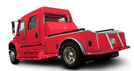
Candy Apple Red