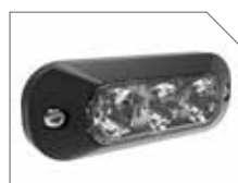
FRONT STROBE LIGHTS