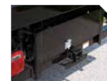
CLASS V RECEIVER HITCH