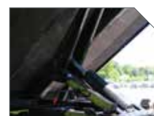
BODY RAISE INDICATOR