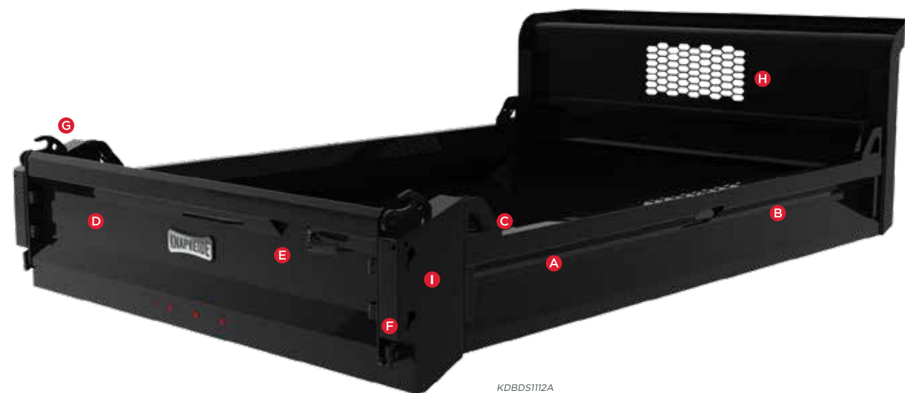
KDBDS1112A *Body may be shown with optional features

constructed of 10-gauge high tensile steel with a punched window for visibility