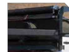
STRAIGHT FULL CAB PROTECTOR