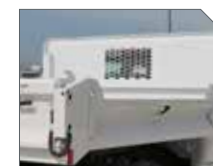
STRAIGHT QUARTER CAB PROTECTOR

'-P' denotes prime paint; '-B' denotes black finish paint.