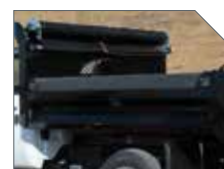
POLY BOARD EXTENSIONS