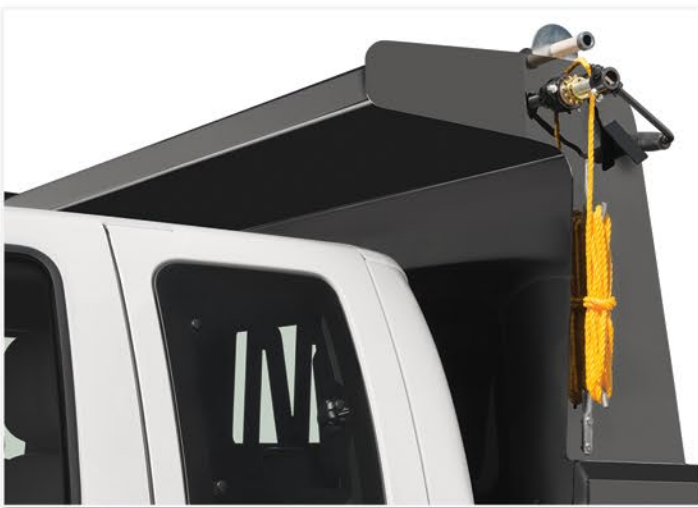
Morgan's optional bulkhead-mounted Pull-Tarp is easy to use, easy to store, and meets D.O.T. mandates for load-securement.

From the ability to accommodate a variety of hitch and hoist configurations, to your choice of features designed specifically to add ease and convenience to the work you do every day, Morgan options support greater productivity -- and THAT translates to a better bottom-line!