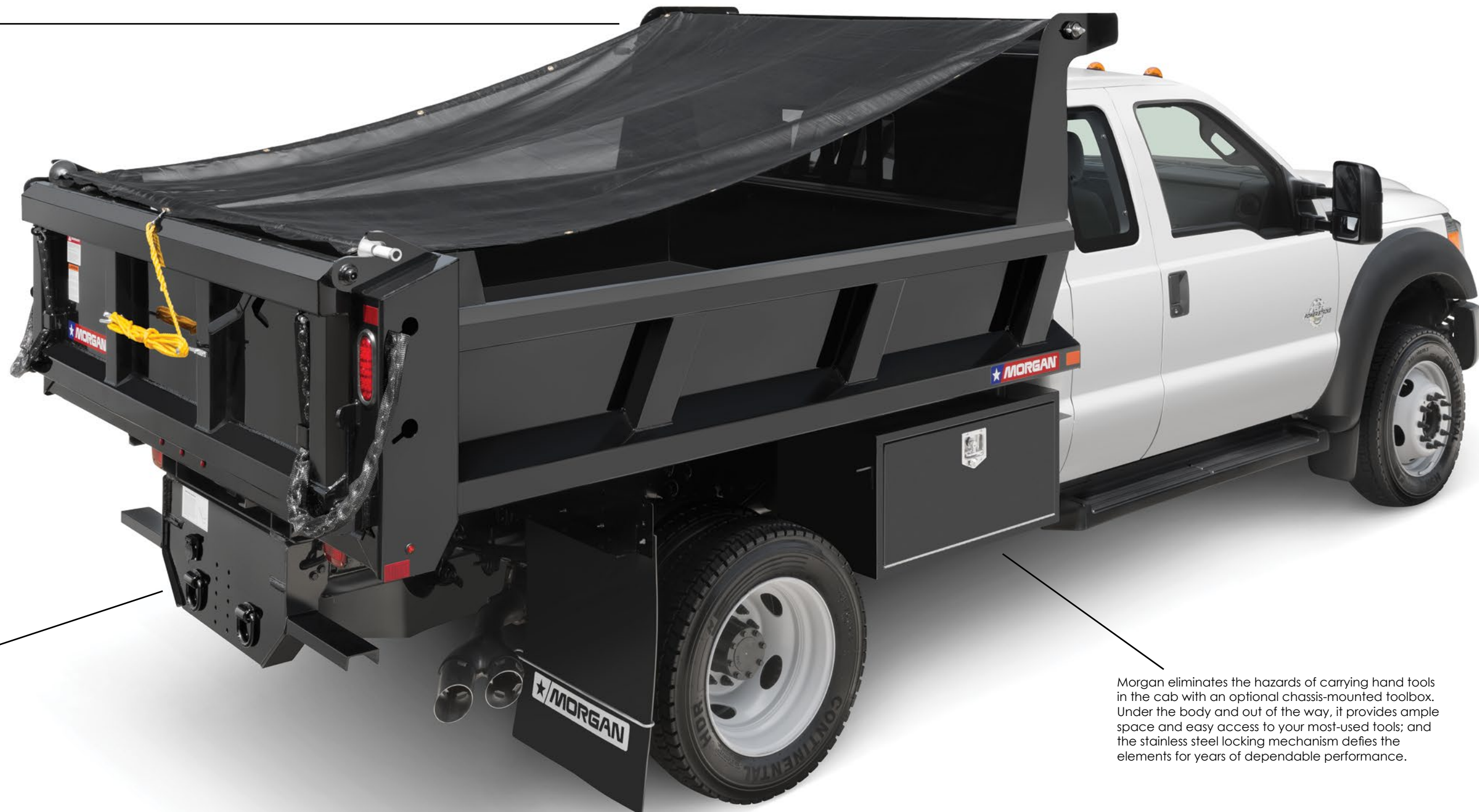
Morgan's heavy-duty hitch plate and tow rings make it easy to mount any hitch configuration and safely tow.