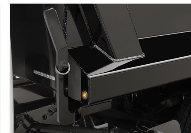
Single, and separate rubber-coated drop and swing-gate handles make it easy for one-person to release and re-secure the dump gate.