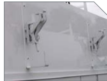
SIDE MOUNT LADDER RACK