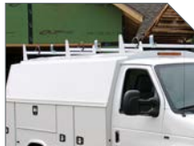
3 BOW LADDER RACK