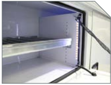
LED COMPARTMENT LIGHTS