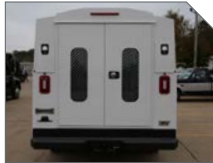
REAR DOOR WINDOWS