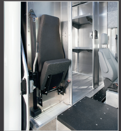
Optional jump-seat, level cab to cargo area transition with non-slip grit surface