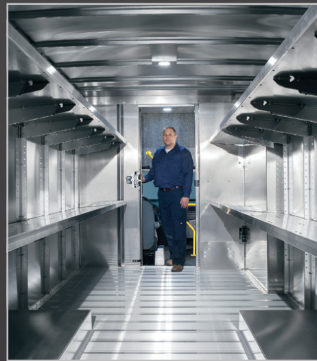
Heavy duty shelving and sliding bulkhead door with Kason latch