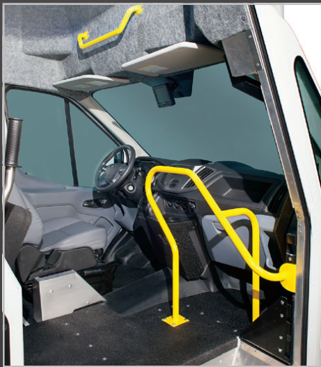
42" wide sliding door opens to spacious cab area with Three Points of Contact grab bars