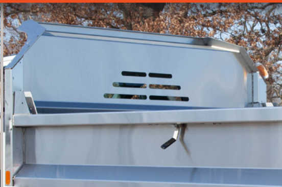
Bulkhead with Window