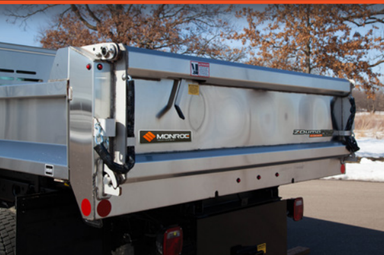
Quick Drop Tailgate