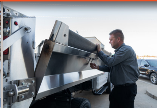
Fold Down Sides