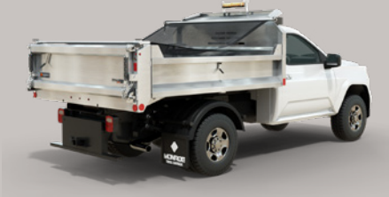
Z-DumpPRO® | Elite