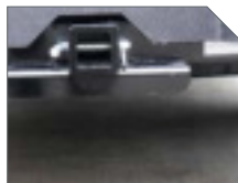
CLASS V RECEIVER HITCH