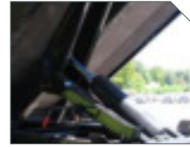
BODY RAISE INDICATOR