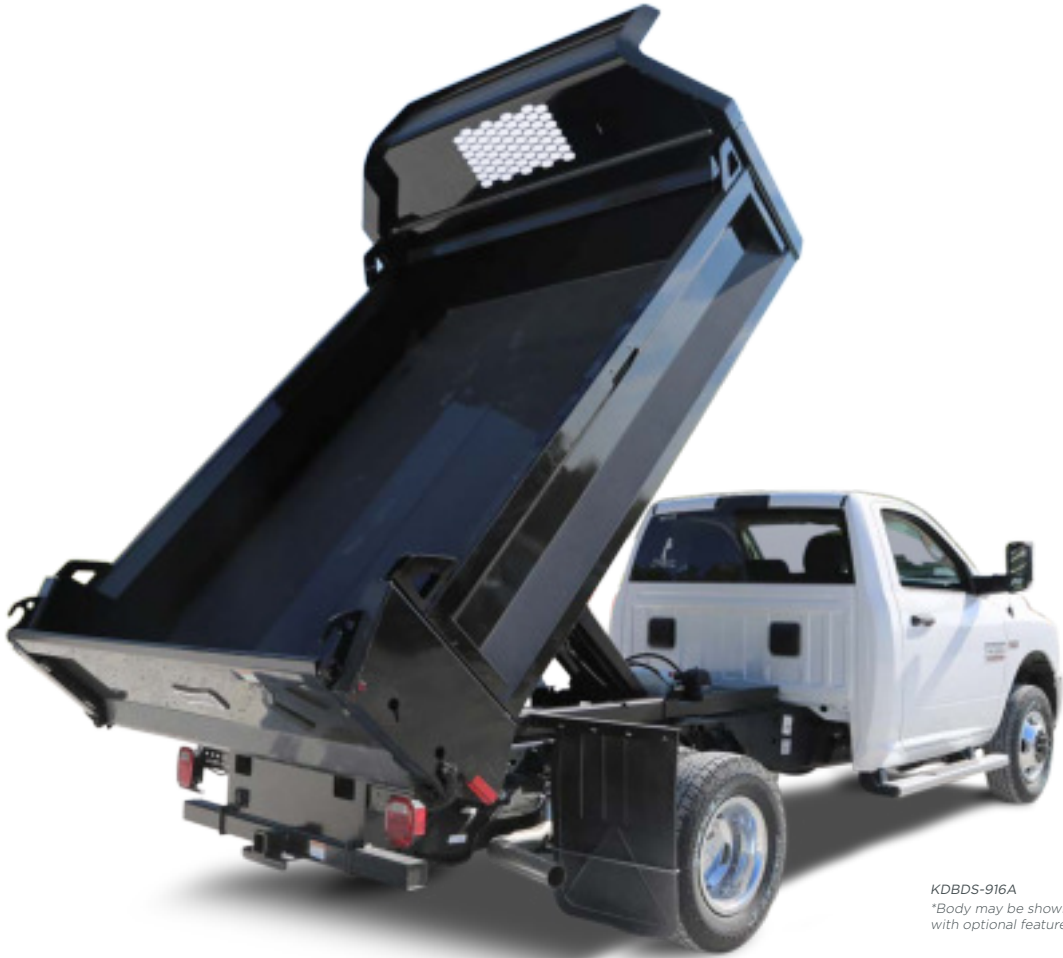
KDBDS-916A *Body may be shown with optional features

Models come standard in prime paint. *Models marked with an asterisk available in black finish paint, denoted by '-B' at end of sales model.