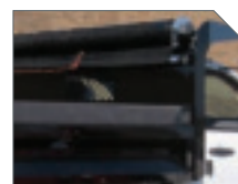
STRAIGHT FULL CAB PROTECTOR