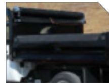
POLY BOARD EXTENSIONS