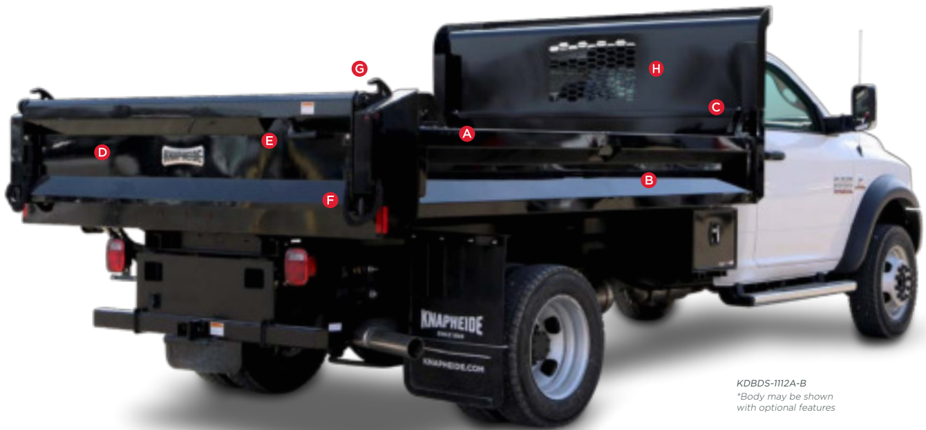
KDBDS-1112A-B *Body may be shown with optional features

Select from a variety of options to make your dump body a perfect fit.