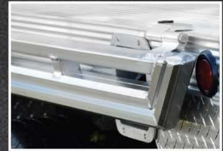
Optional Extruded Aluminum Fold Down Rails with Accessory Track