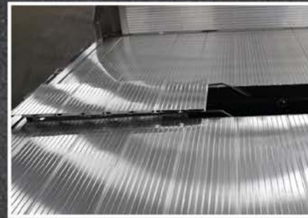
Extruded Flush-Mount Gooseneck Hatch Cover