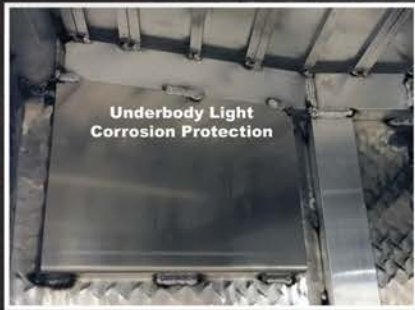
Stop Turn Tail Light Corrosion Protection

For more information, visit DuraMagTruckBodies.com