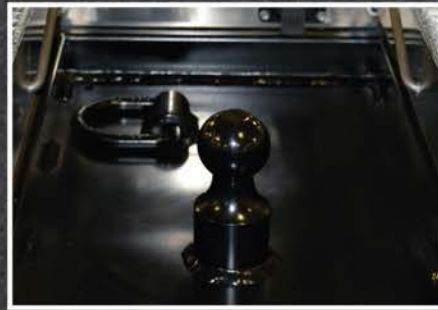
Integrated Gooseneck Ball with D-Rings & 7-Way Plug