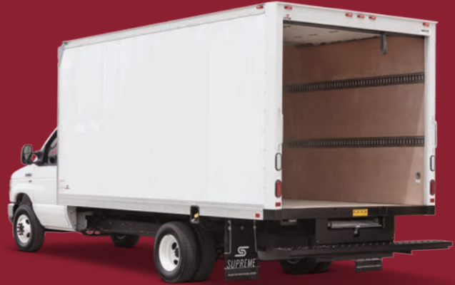
(Shown with optional E-Track, one-way poached step bumper, and ramp)

Supreme sets the benchmark for cutaway truck bodies. Featuring a cab-access door, flat floor, and tight turning radius, our tough, sturdy Iner-City cutaway is ideal for shorter, multi-delivery routes, effortlessly carrying your cargo. Versatile and rugged, the Iner-City helps you get through the workday with dependable efficiency.