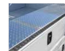
ALUMINUM TREAD PLATE TRIM