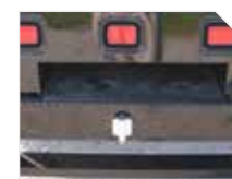
UNDERBODY STORAGE COMPARTMENT