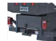
CLASS V RECEIVER HITCH WITH ICC BUMPER