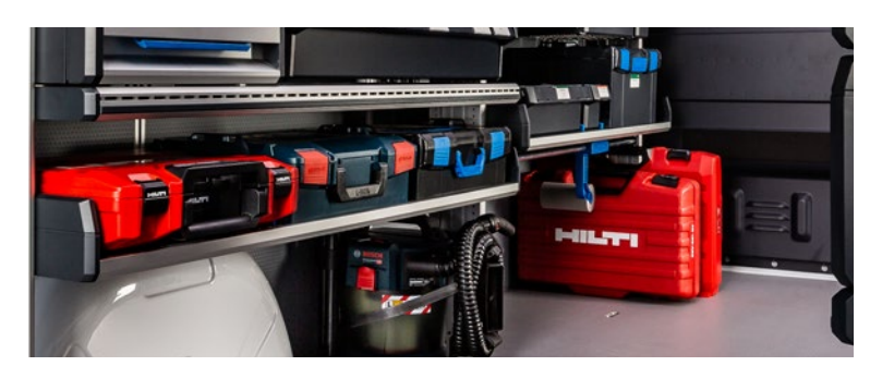
EcoSystem – Securely transport BOXXes on your shelving, thanks to integrated mounting points.(Compatible with Bosch, Hilti, etc.)