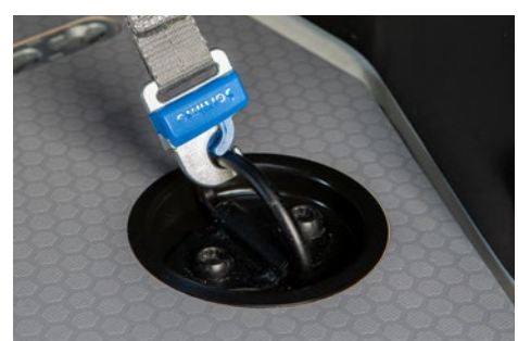
ProSafe – well thought out cargo management on your shelving and in your vehicle. Also fits your existing original lashing points.