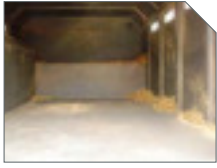
COAL TAR INTERIOR