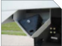
FORESTRY CHOCK HOLDERS