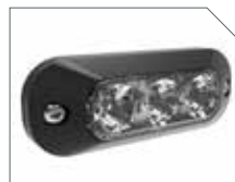
FRONT STROBE LIGHTS