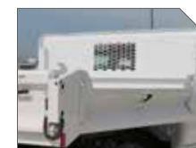
STRAIGHT QUARTER CAB PROTECTOR

-P denotes prime paint; -B denotes black finish paint. GM C/K 3500 chassis applications