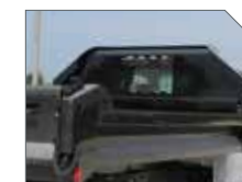
TAPERED QUARTER CAB PROTECTOR