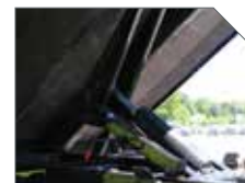
BODY RAISE INDICATOR