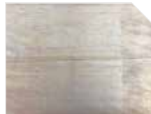
APITONG WOOD FLOOR