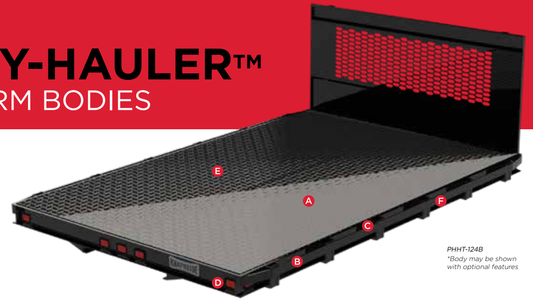
PHHT-124B *Body may be shown with optional features

The Heavy-Hauler™ (PHH) is Knapheide's most rugged platform, designed to handle the most severe of hauling applications. It has been engineered to work in both hoist and non-hoist applications.