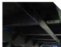
UNDERBODY TIE-DOWN RAILS