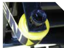
UNDERBODY SLIDING TIE-DOWN CHANNEL