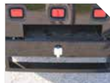
UNDERBODY STORAGE COMPARTMENT Available in 8' and 10' lengths