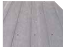
POLY BOARD FLOOR