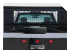
SPARE TIRE RETAINER