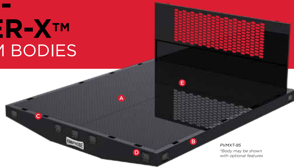
PVMXT-95 *Body may be shown with optional features

Knapheide's most popular platform, the Value-Master-X™ (PVMX), is a value-priced standard duty platform with distinctive tail skirt styling. It has been engineered to work in both hoist and non-hoist applications.