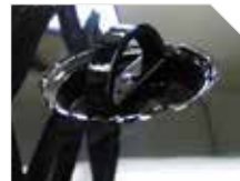
INTEGRATED D-RING TIE DOWNS