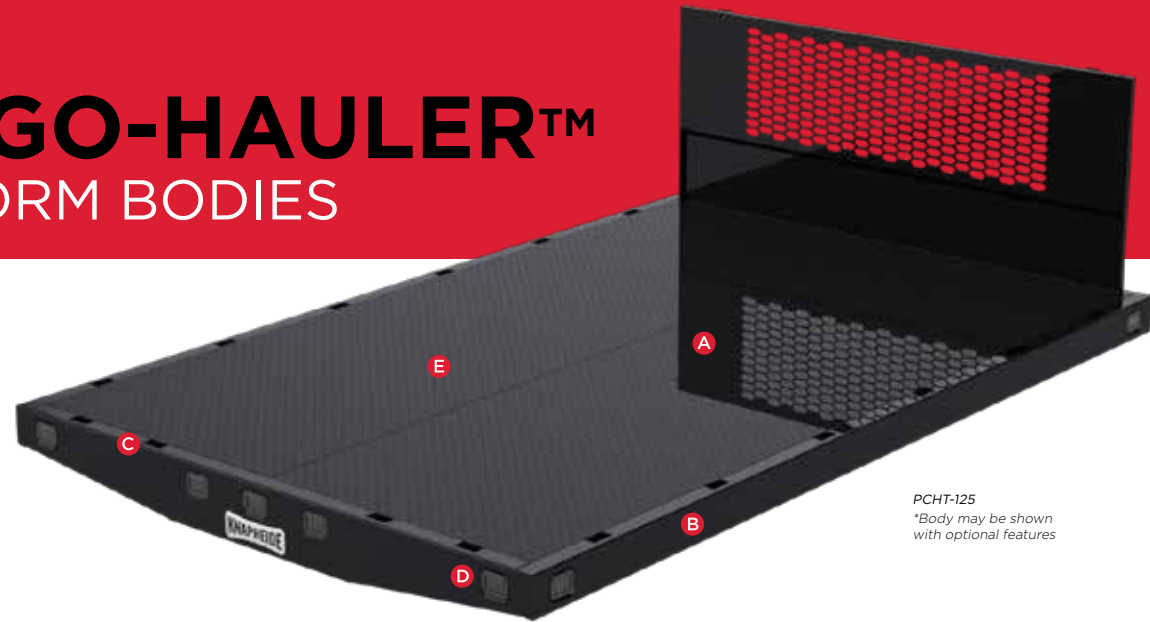
PCHT-125 *Body may be shown with optional features

Knapheide's Cargo-Hauler™ (PCH) platform has a robust understructure to withstand tough job site applications. The PCH is a heavy duty platform with distinctive tail skirt styling. It has been engineered to work in both hoist and non-hoist applications.