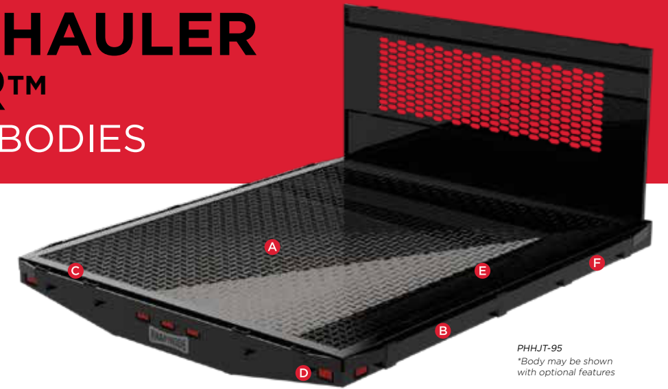
PHHJT-95 *Body may be shown with optional features

The Heavy-Hauler Junior™ (PHHJ) is a durable, standard duty platform with distinctive tail skirt styling and rub rails. It has been engineered to work in both hoist and non-hoist applications.