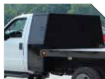
KNAP-PACK Also available in straight and tapered sides