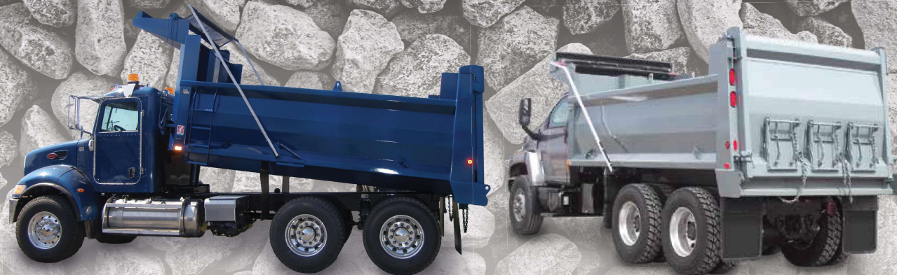
THE BODIES SHOWN MAY HAVE OTHER INSTALLED OPTIONS.

The ultimate materials hauling body. Light to medium-duty, super lightweight, ALL-Hardox bodies. Fully-formed, one-piece sides with no external weldments. The DCS is recommended for the weight-conscious who haul high volume, light materials such as sand, dirt, gravel and asphalt. The DCS+ allows the user to apply the body to heavier-duty hauling such as larger rock and more.