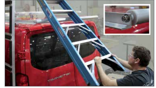
"Load-EZ" roller bar assists with loading to roof rack