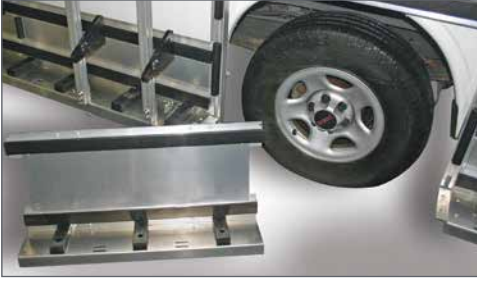
Removable wheel skirt for hassle-free tire changes