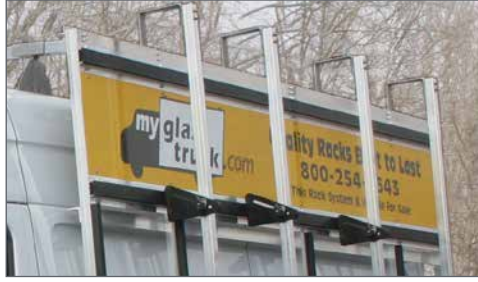
Sign panel with graphics