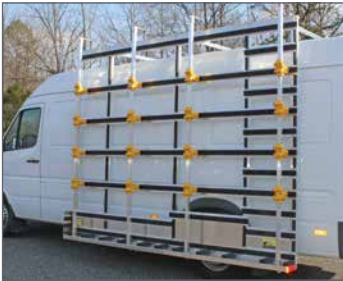
Slat ladder for easy access to optional roof rack