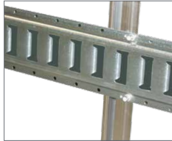
E-track cargo control system