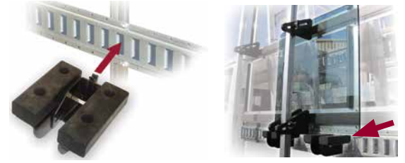
Transport glass on upper portion of rack when the bottom ledge is occupied. Row of E-track required (Sold Separately).