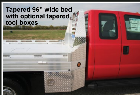
Tapered 96" wide bed with optional tapered tool boxes