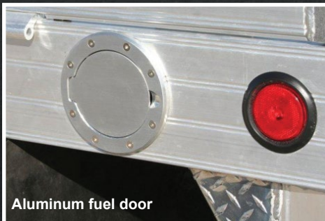
Aluminum fuel door