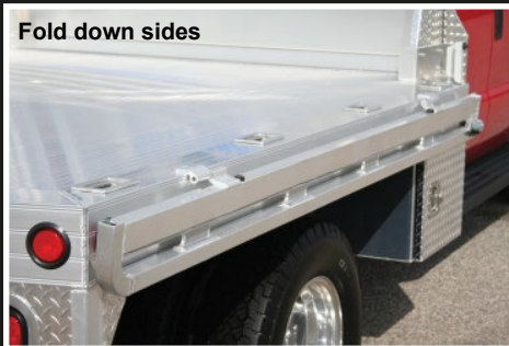
Fold down sides