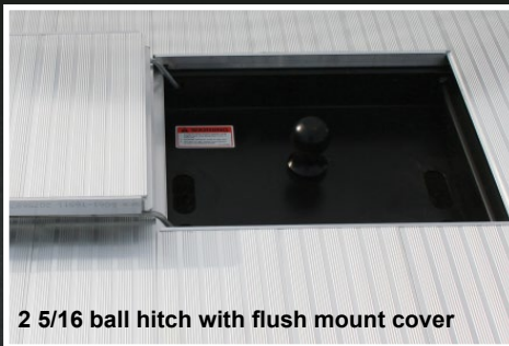
2 5/16 ball hitch with flush mount cover