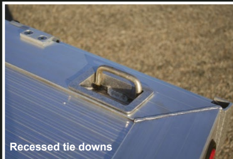
Recessed tie downs