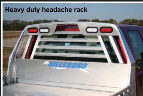
Heavy duty headache rack