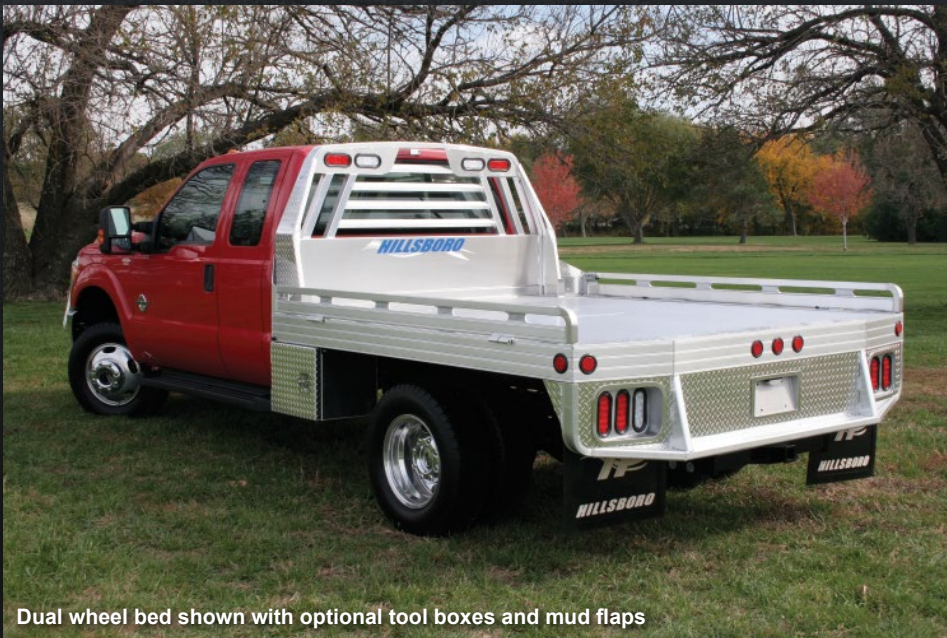
Dual wheel bed shown with optional tool boxes and mud flaps