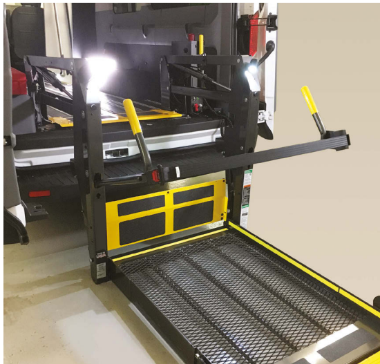
Side and rear access wheelchair lifts are available with 800 lb and 1,000 lb weight capacities.