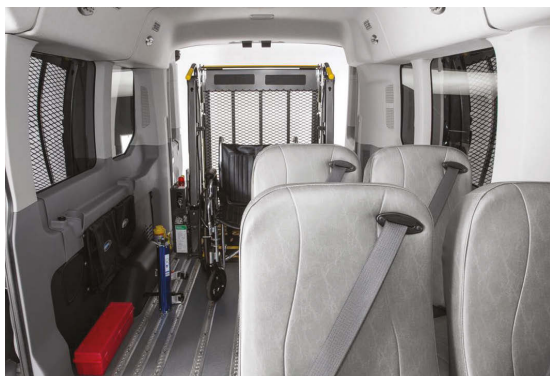
Inside view of paratransit van with SmartFloor system and wheelchair lift in rear location.