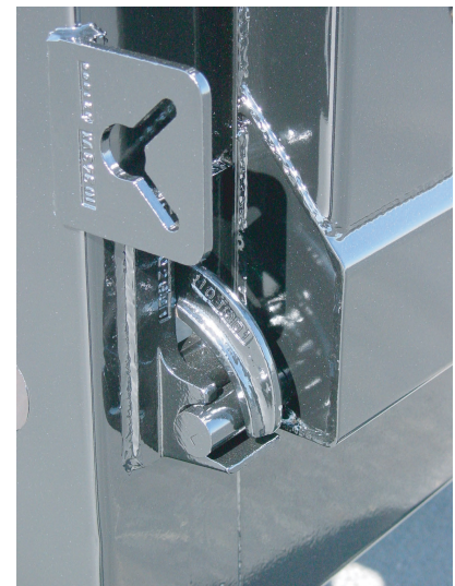
Lower tailgate latch is 4140 grade cast steel. Latch pivots are bushing type width 1 1/4" diameter pin for extra support.