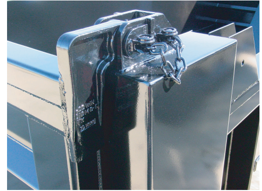
Tailgate hardware is cast steel with grease fittings.

Air tailgate latch, 36" cab shield, 8 gauge sides, 3/16" one piece floor, 6 panel tailgate, Center coal door, Grip strut walkrod, Horizontal bracing, Asphalt chute, Front corner posts