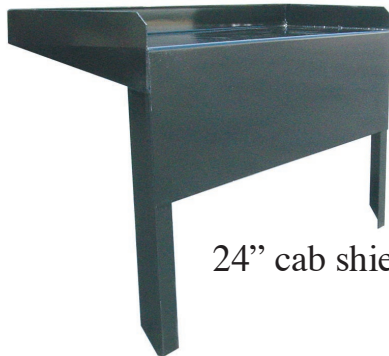
24" cab shield

Visit Godwin Manufacturing and all affiliated companies on the world wide web. www.godwinmfg.com