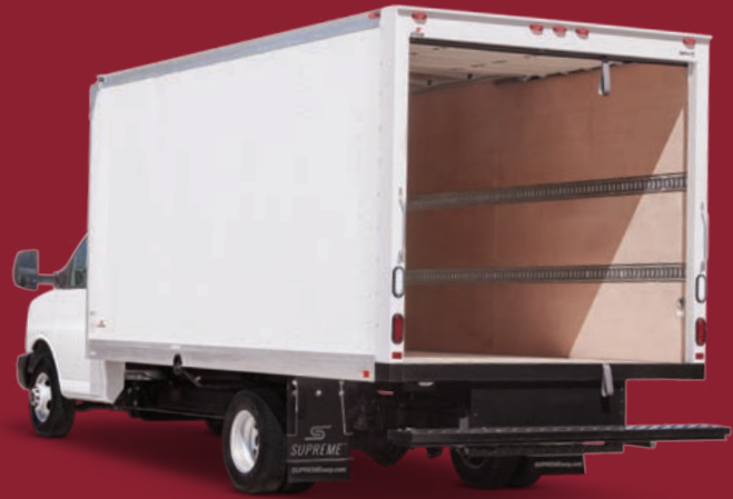
(Shown with optional E-Track and one-way poached step bumper)

Supreme sets the benchmark for cutaway truck bodies. Featuring a cab-access door, flat floor, and tight turning radius, our tough, sturdy Iner-City cutaway is ideal for shorter, multi-delivery routes, effortlessly carrying your cargo. Versatile and rugged, the Iner-City helps you get through the workday with dependable efficiency.