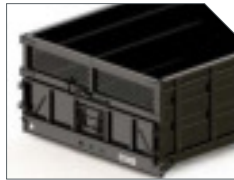
REAR CARGO GATES WITH TAILGATE AND METERING CHUTE