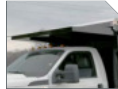
42" CAB PROTECTOR WITH 4 TIE DOWNS