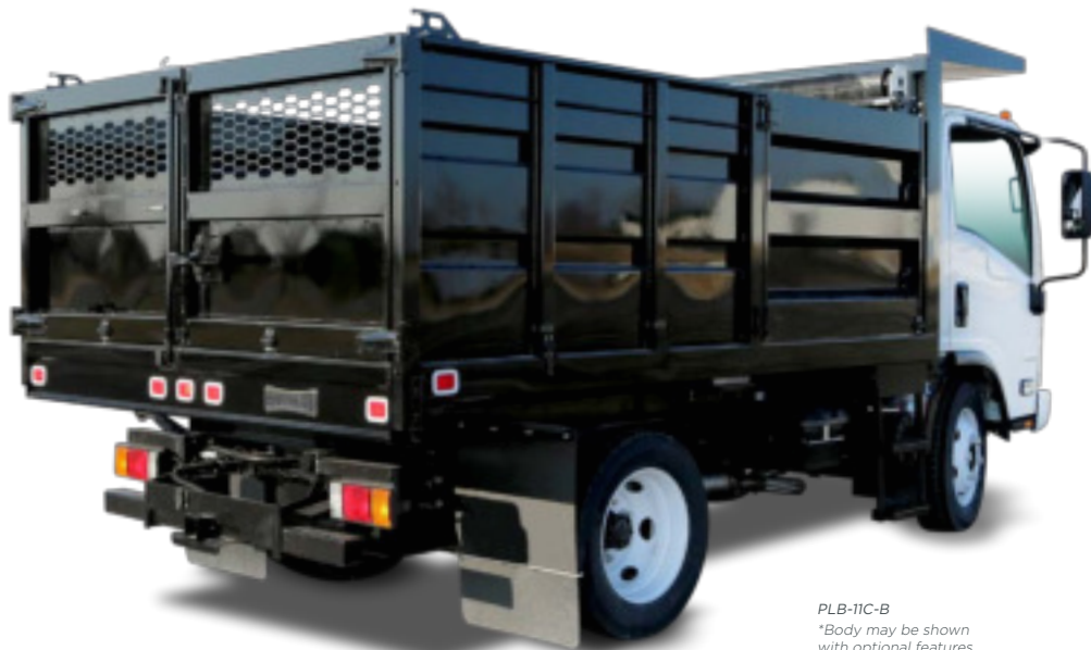
PLB-11C-B *Body may be shown with optional features