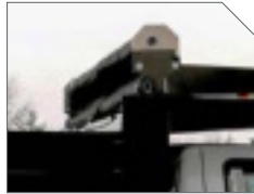
PULL TARP SYSTEM