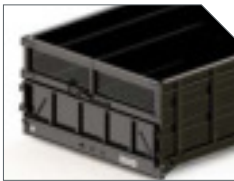
REAR CARGO GATES WITH TAILGATE