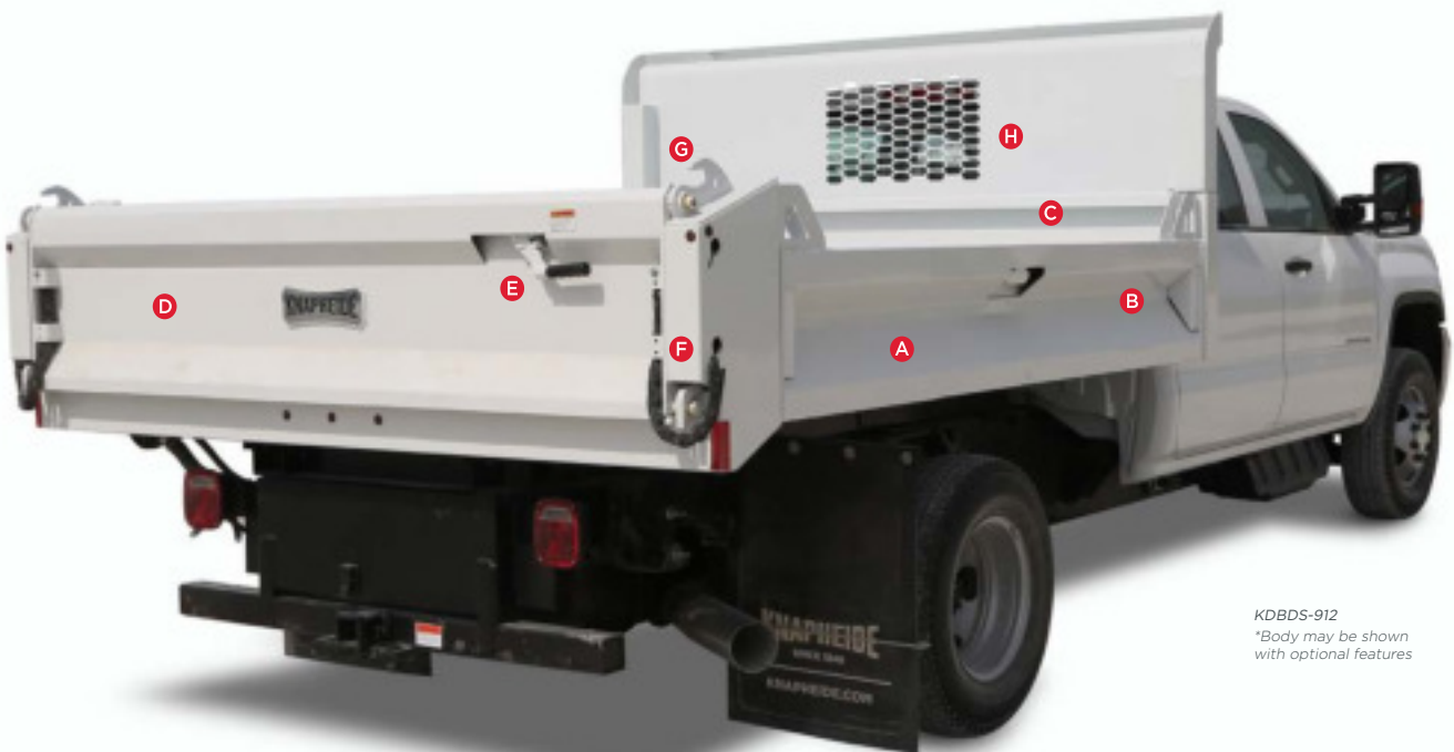
KDBDS-912 *Body may be shown with optional features

Select from a variety of options to make your Dump Body a perfect fit.