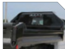
TAPERED QUARTER CAB PROTECTOR