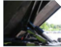
BODY RAISE INDICATOR