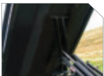
// CROSSMEMBERLESS UNDERSTRUCTURE