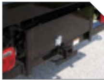
CLASS V RECEIVER HITCH