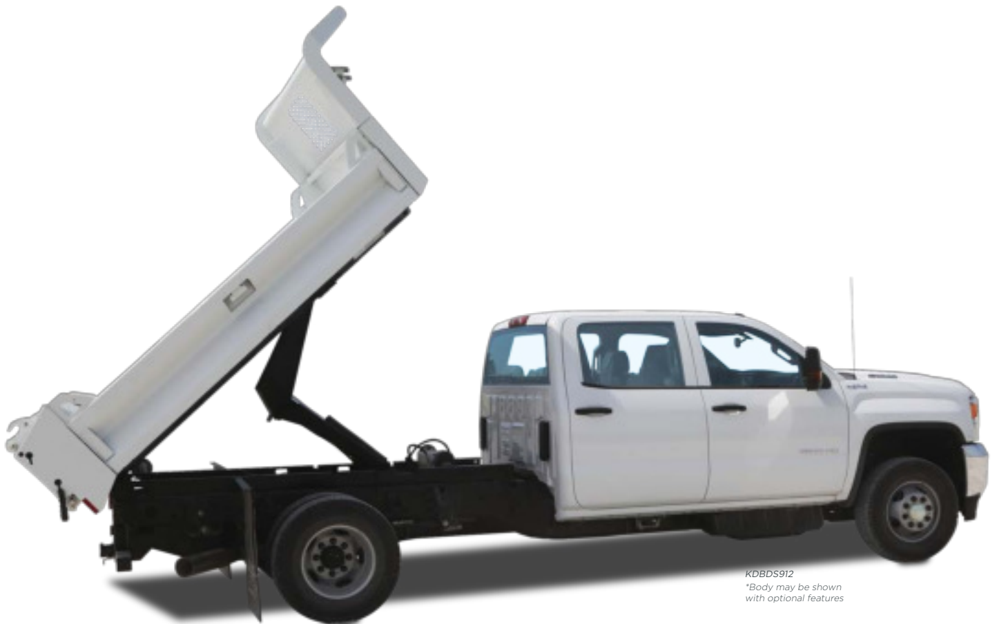
KDBDS912 *Body may be shown with optional features