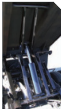
// SUBFRAME HOISTS