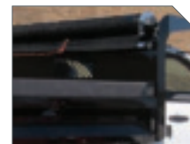
STRAIGHT FULL CAB PROTECTOR