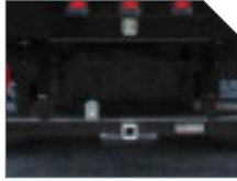
8' UNDERBODY STORAGE COMPARTMENT