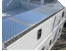
ALUMINUM TREAD PLATE OVERLAY